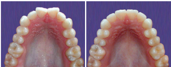
Rotated, crowded anterior teeth.

At first glance you may think you need braces, however with the patented Inman Aligner, your front teeth can be gently guided to an ideal position quickly and effectively, in a matter of weeks.